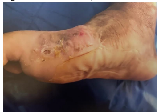
Figure 9. Final result. Day 120.