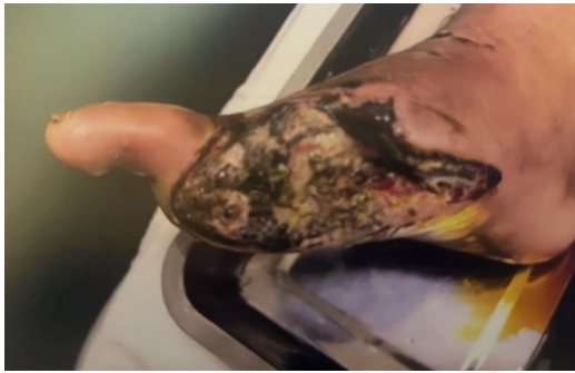
Absence of the first toe of the right foot.