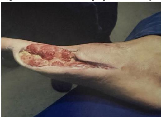
Figure 4. Area of the foot prepared for the graft.